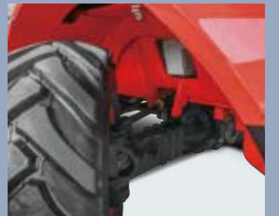
Oscillating steer axle allows either wheel to step over obstacles keeping the truck and load level