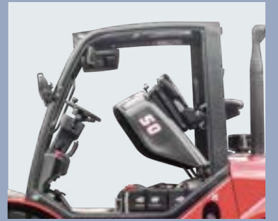
The easy-to-open hook provides quick access to the engine compartment