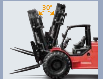
The tilt angle of the mast is 15° in the front/15° in the back, which is more suitable for loading, unloading and transportation of goods in off-road conditions