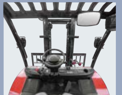
To achieve maximum productivity, a rough terrain forklift operator needs to be comfortable and in control. We've created a workplace that gets the best from your operators and your machinery