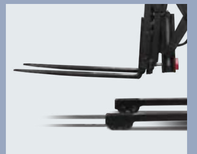
Proportional controlled forks can be operated more accurately