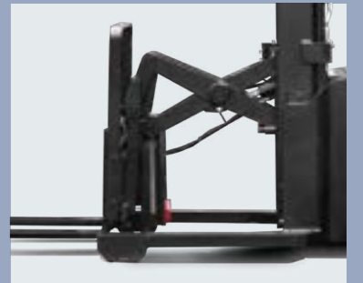
Forks move forward by the scissor structure