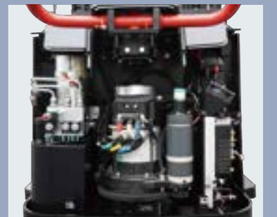
Back cover can be opened fully