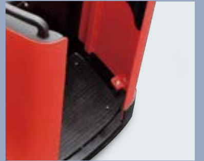
The pedal applies shock absorption design, greatly improve the operator's comfort, reduce the fatigue