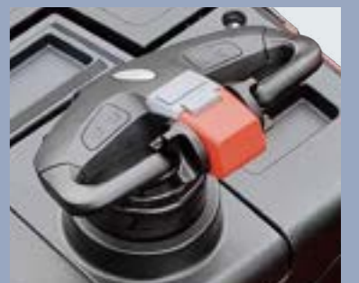
Simple and beautiful tiller designed to make the operator feel comfortable, all the operation can be completed by one hand