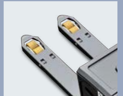
Optimized designing structure to offer a good visibility and easy entrance of the pallet