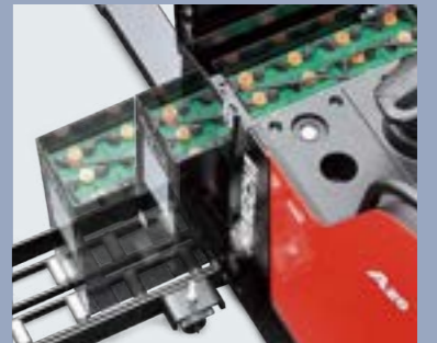
Side battery change is standard feature