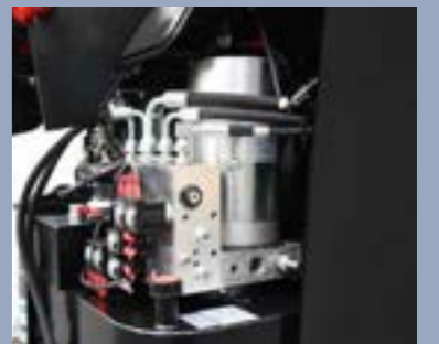
BUCHER hydraulic unit