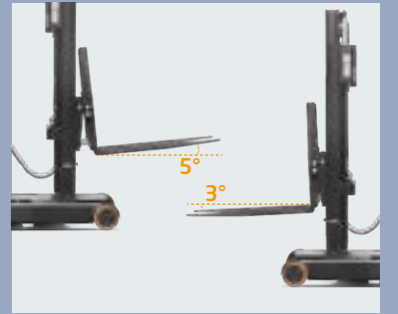
Fork tilt F/R: 3° / 5°