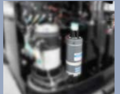
EPS (Electric Power Steering) is standard specification